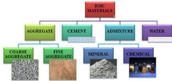
Materials used in RMC