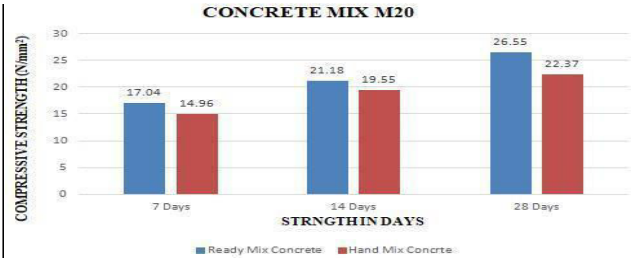
Fig 6.2 : Bar chart showing comparison of RMC & HMC